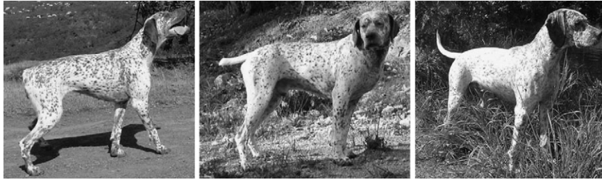
Figure 1. Illustration of Bourbonnais Pointer dogs showing a tailless (anury) phenotype on the left, a short-tail (brachyury) phenotype in the middle, and a long-tail phenotype on the right.

comparison, another likely recessively inherited type of bobtail exists in Bulldogs where all dogs in the breed have short tails with multiple kinks (Whitney 1947). There are also occasional reports of short-tailed dogs born from long-tailed parents in some breeds, revealing multiple patterns of inheritance or variations in penetrance.